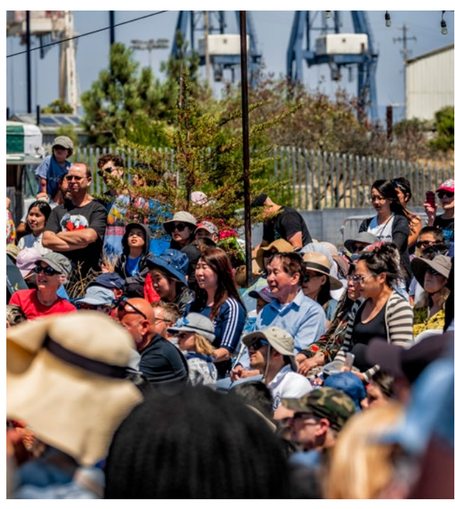
Artwork and Photo credits | Page 1 - illustration by Sophia Zaleski; Page 2 Photo by the Port of San Francisco licensed under CC BY 2.0.