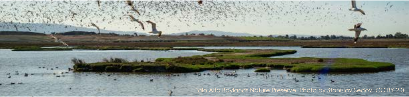
Palo Alto Baylands Nature Preserve.